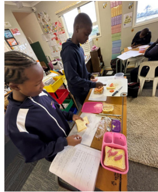
Grade 5 class following instructions on making a sandwich.