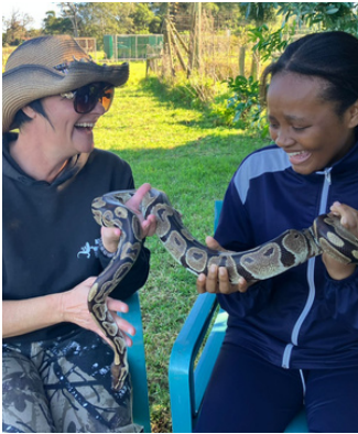
Outing to Animals in Wonderland